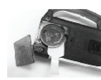
For first time usage, remove the plastic strip to connect the battery.

Unscrew to open the battery compartment.